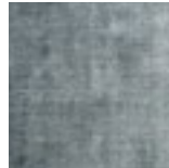
arctic grey & white