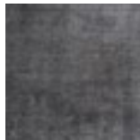
anthracite & white